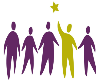
Safe Spaces a safe place

I am puzzled by the concept of 'safe place,' as theoretical proposition or as actual physical space.